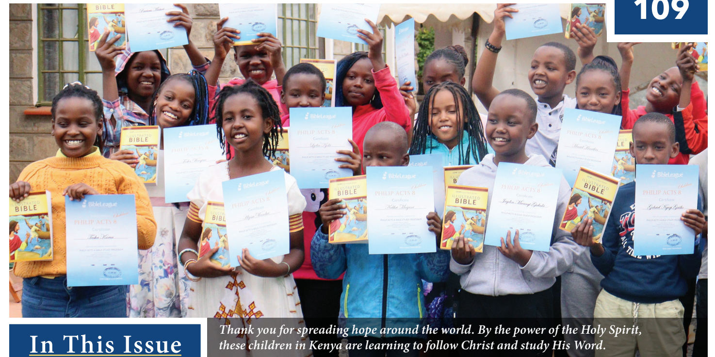
Thank you for spreading hope around the world. By the power of the Holy Spirit, these children in Kenya are learning to follow Christ and study His Word.