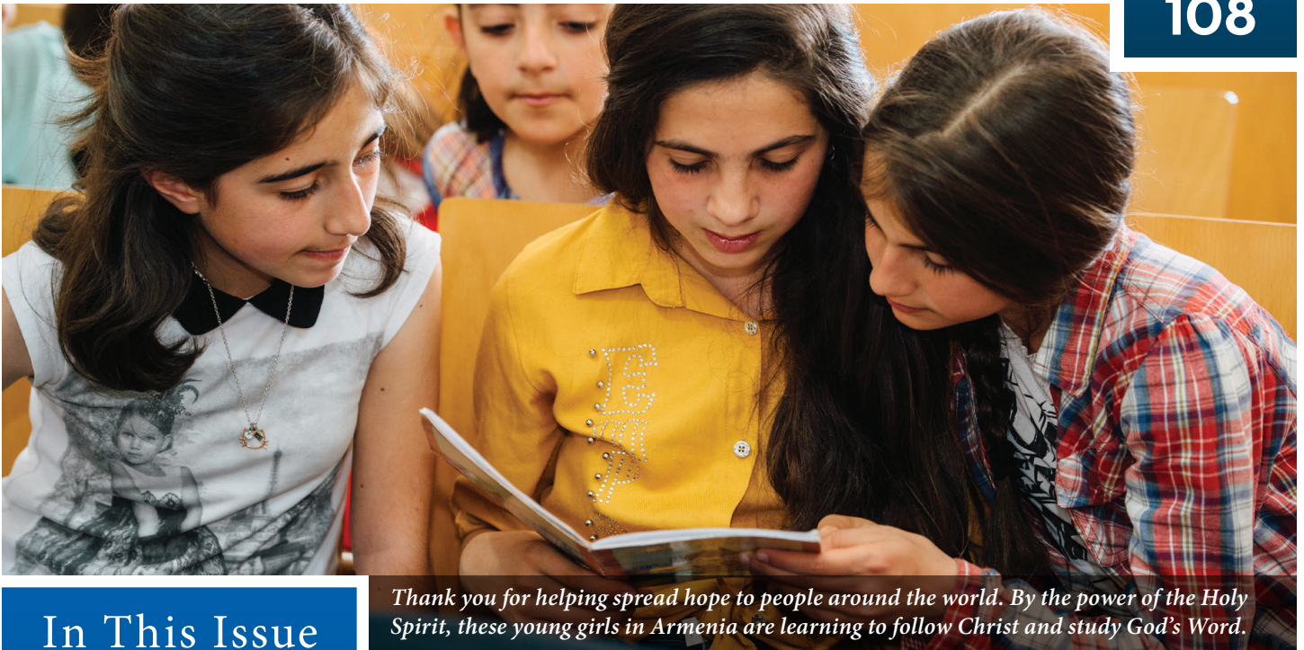
Thank you for helping spread hope to people around the world. By the power of the Holy Spirit, these young girls in Armenia are learning to follow Christ and study God's Word.